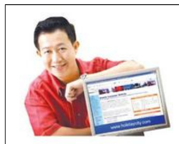
Lee claims HolidayCity.com offers competitive rates at all times.