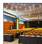
MICE Industry Trends & Markets